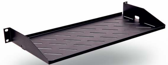
Orientation - B